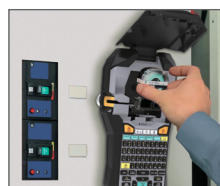
Front loading cassette