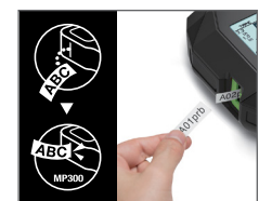
Label retention after cutting