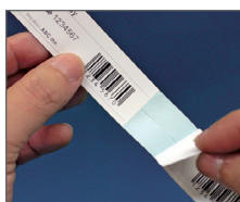
Half cut function