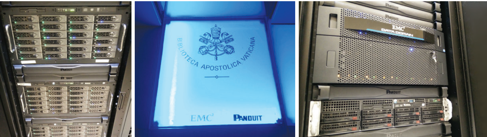
Digitization data backup – EMC 2 Data Domain 2.8 PB of capacity (1.1 TB/hr throughput)

In addition, the data center enhancements would support the Vatican Apostolic Library's commitment to create a setting which allows readers to easily access the manuscripts while avoiding further degradation of the original materials.