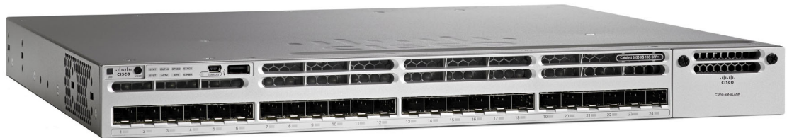
Figure 3 Cisco Catalyst 3850 Switch

To meet the demands of its network refresh and transition plan, the solution for the Costa Rica facility was to deploy a new Resilient Ethernet Protocol (REP) switch ring network (Figure 2). Cisco Catalyst 3850 distribution switches and Allen-Bradley Stratix 5400 industrial Ethernet switches were used for the REP ring switches. The Switch Ready Network Zone System, Pre-Configured Industrial Distribution Frame (IDF), and fiber and copper connectivity and accessories from Panduit were also installed. For more information on REP, see the Deploying A Resilient Converged Plantwide Ethernet Architecture Design and Implementation Guide ( www.panduit.com/cpwe ).