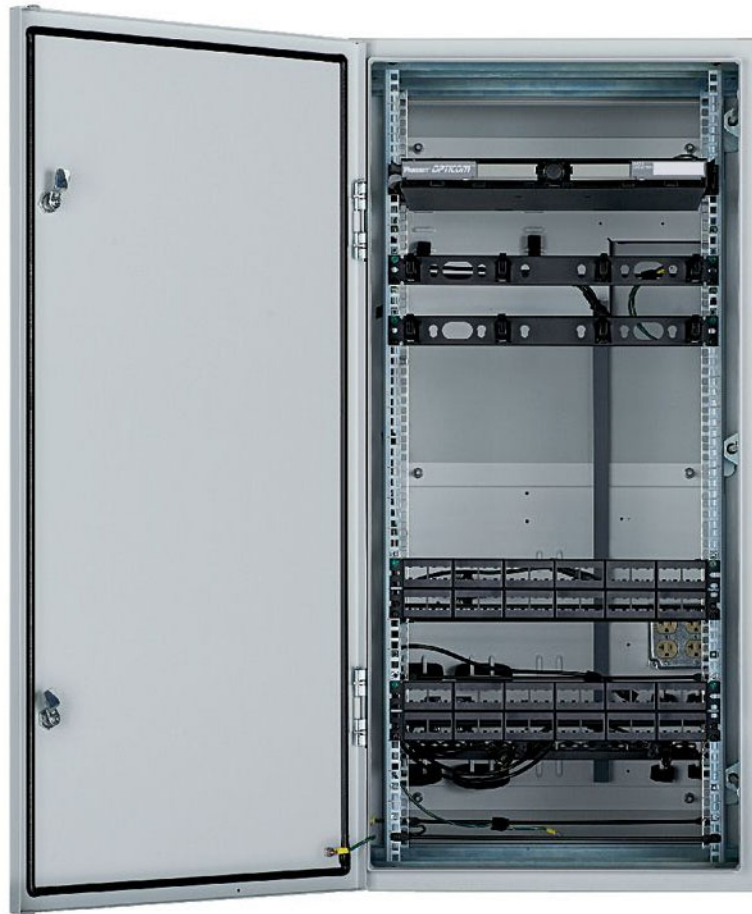
Figure 5 Panduit Pre-Configured IDF