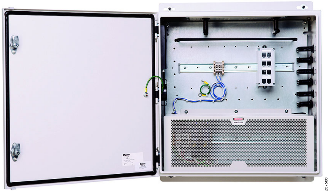
Figure 6 Panduit Switch Ready Network Zone System (PNZS)

The Panduit Switch Ready Network Zone System (PNZS) (Figure 6) allows for rapid deployment of the industrial networking equipment required to connect the plant floor. It includes copper and fiber connectivity, patching for the uplinks and downlinks, and a steel enclosure for reliability and improved security. It also includes power features to minimize engineering and installation time for faster implementation.