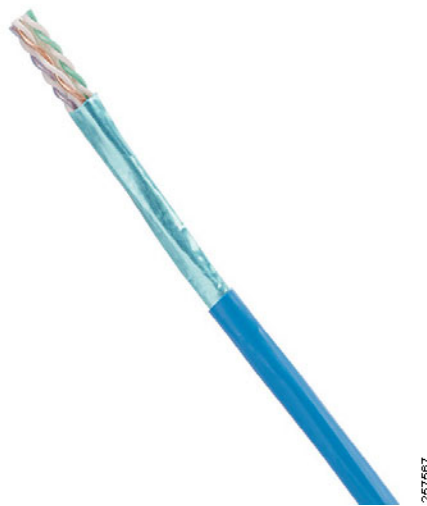
Figure 7 Panduit TX6A™ UTP Copper Cable with Vari-MaTrix Technology

The industrial network's backbone consists of OS2 single-mode fiber-optic cabling and enhanced Category 6A UTP copper cabling (Figure 7) with Vari-MaTrix Technology. Panduit OS2 single-mode fiber-optic cabling is an essential part of the Panduit end-to-end fiber-optic solution, designed to support today's data