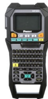
PXE™ Mobile Printers