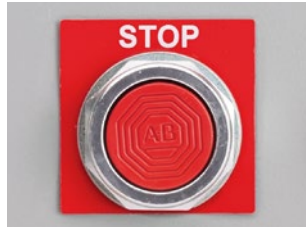
Raised Panel Labels