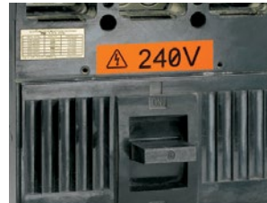
Electrical Hazard Labels