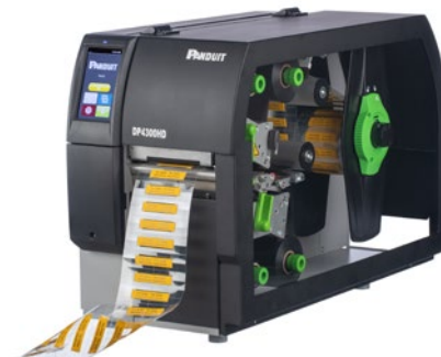
DP4300HD Two-Sided Printer