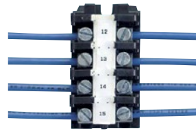
Terminal Block Labeling