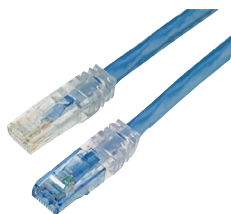
Keyed UTP Copper Patch Cords

Keyed patch cord type is indicated by patch cord color. Select a jack (above) of the same color as the patch cord to match the keyed configuration.